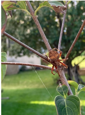
Make sure photo is in focus.