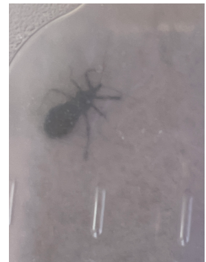
Have a way to measure but out of focus.