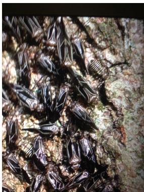
Out of focus.