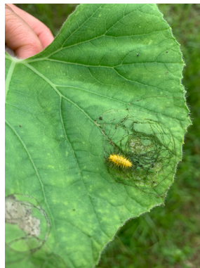
Too far away.